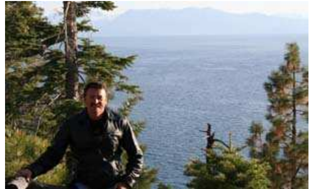
Lake Tahoe, California