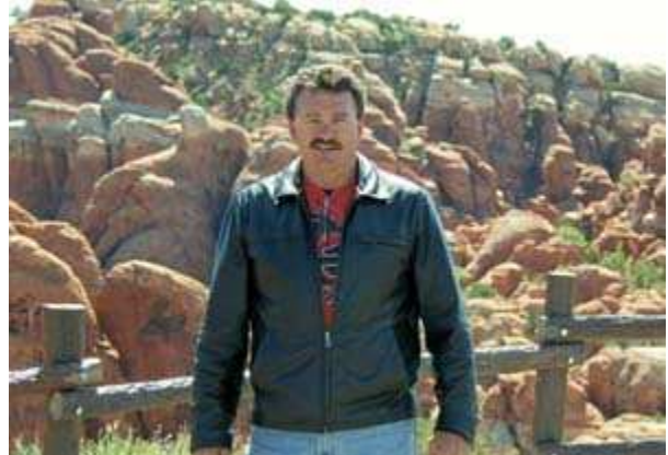
One highlight of my tour through the west was visiting Arches National Park near Moab, Utah.

If people can experience God through a personal testimony, see with their own eyes, and hear with their own ears that they can make it, then my efforts will not be in vain.